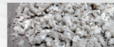
PE washing and squeezing dry film / PE膜水洗擠乾料