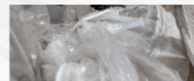
PE film / PE膜