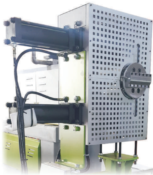
▲ 雙柱 Double pistons