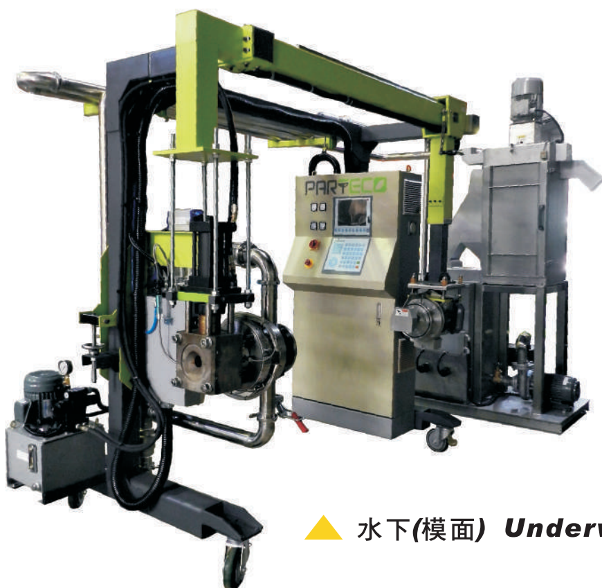
▲ 水下(模面) Underwater