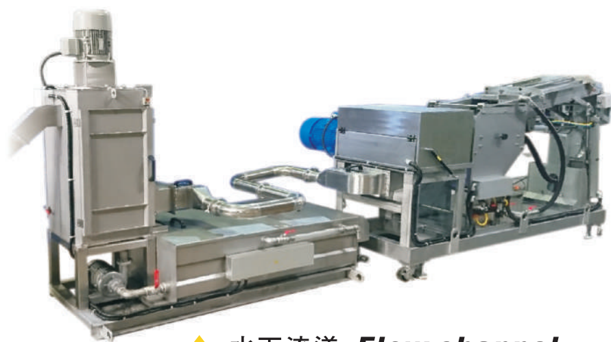
▲ 水下流道 Flow channel