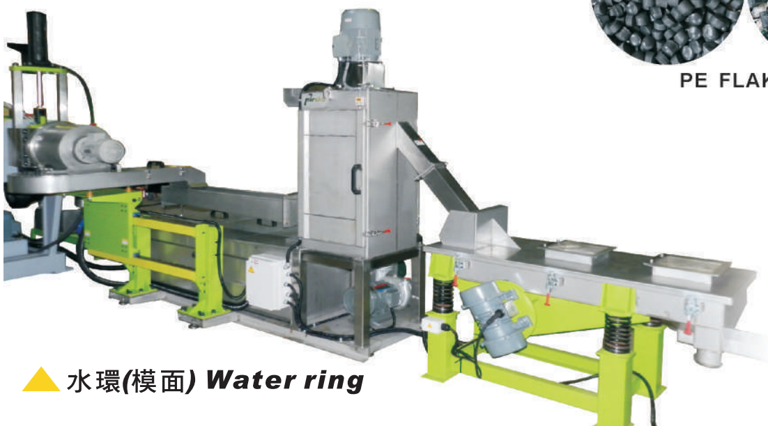
▲ 水環(模面) Water ring