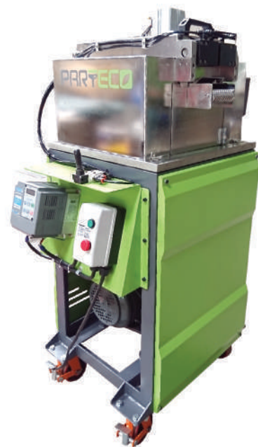
▲ 切粒機 Pelletizer