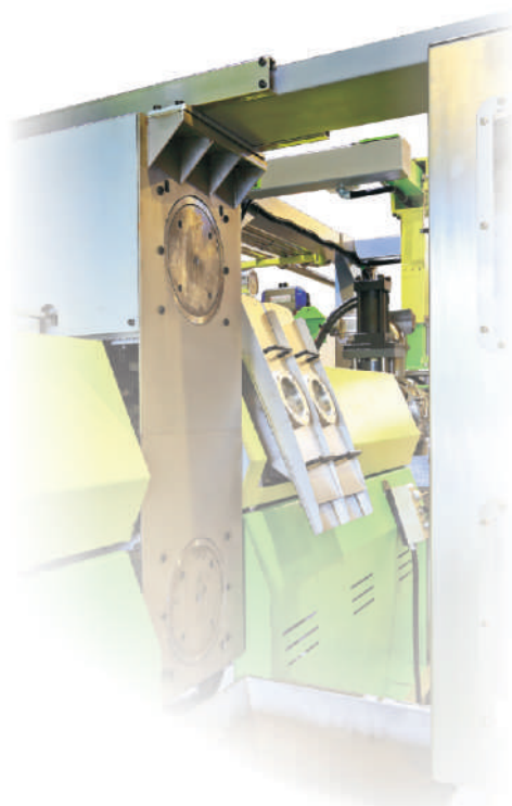
▲ 反洗式 Back flush