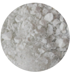
PET BLOCK+ chemical fiber